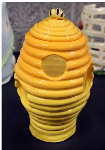
Ashley Z., Class of 2027